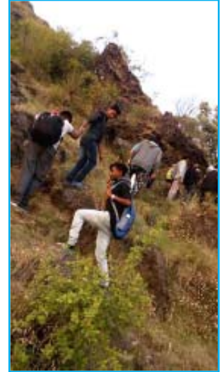
YOUTH CAMP MAY 7-13, 2019 AT VAN NIWAS, NAINITAL