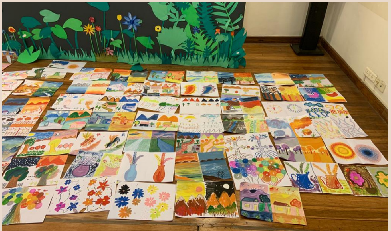
Participants Art Creations.