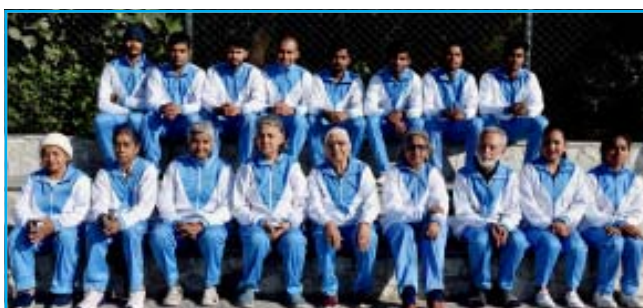
Aspirants with mentors