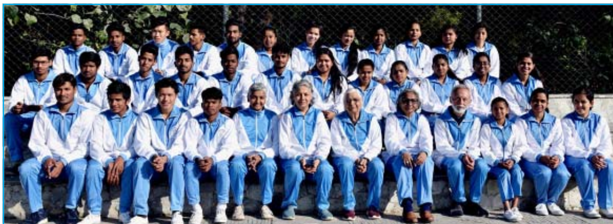
Vocational Trainees with mentors