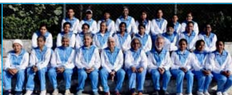
Teacher Trainees with mentors